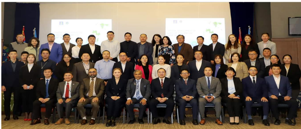
26-28 September 2023 Ulaanbaatar, Mongolia