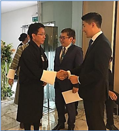
H.E. Mr. Damcho Dorji, Minister of Foreign Affairs, Kingdom of Bhutan.